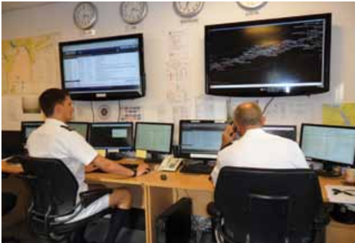
Operations room UKMTO

It is important that vessels and their operators complete both the UKMTO Vessel Position Reporting Forms and register with MSCHOA